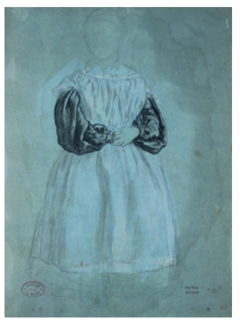
Edgar Degas A young girl standing – portrait of Giovanni Bellelli 1858/59

The Prat Collection is the foremost collection of its kind outside of museums. It is devoted entirely to artists of the French school from the 17th century to the 19th century and features many of the towering names in the history of art.