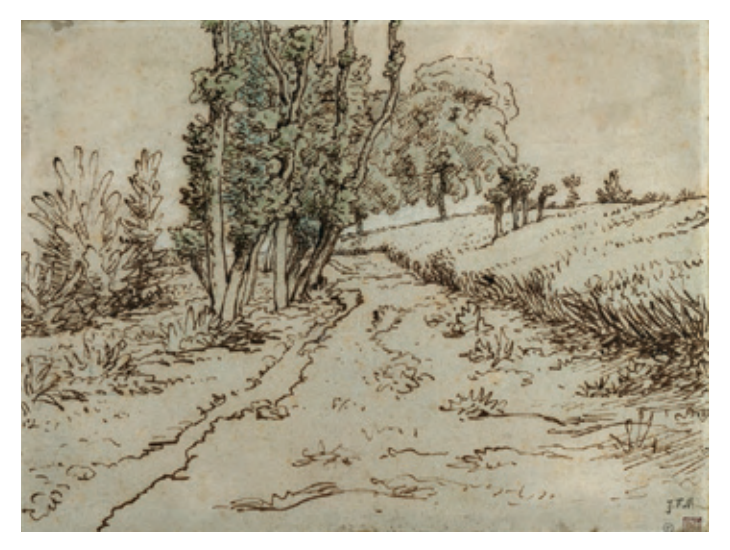
Jean -François Millet Landscape near Vichy, 1866/68