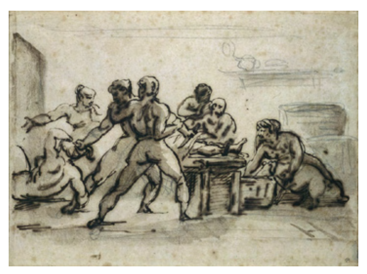
Théodore Géricault The murder of Fualdès, after 1817

The exhibition is accompanied by a fully illustrated catalogue together with a series of public programs including drawing workshops, lectures, celebrity and exhibition talks and children's programs. For full details see www.artgallery.nsw.gov.au.