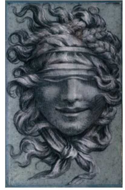
Pierre-Paul Prud'hon Fortune c1800