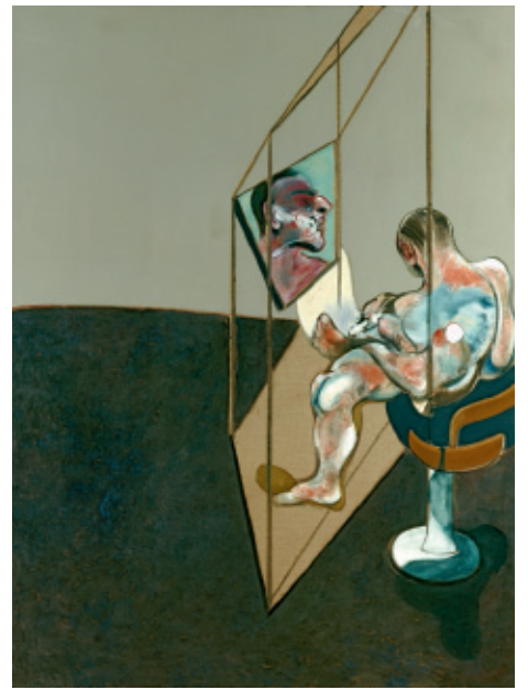
Three studies of the male back, triptych 1970 Kunsthhaus Zürich, Vereinigung Zürcher Kunstfreunde