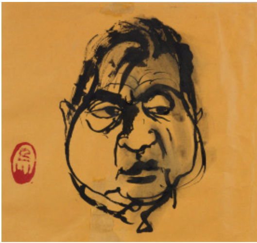
above from left: Brett Whiteley Francis Bacon c1984–89 Private collection; Photographic contact sheet of Francis Bacon sitting for Brett Whiteley at Bacon's South Kensington studio, October 1984