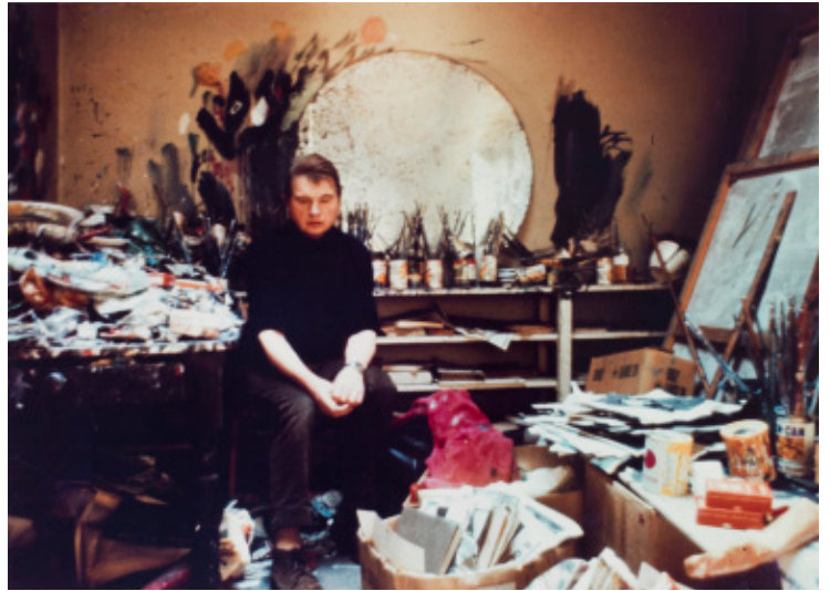
Francis Bacon in his Reece Mews studio, May 1970.

'Francis Bacon: five decades presents a dazzling picture of a complex and conflicted artist whose work retains its visceral impact 20 years after his death. It's an exhibition not to be missed.'