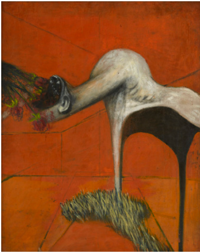
Study for a figure at the base of the crucifixion 1943–44 (and cover detail)